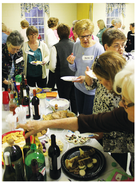
WINE AND FOOD ARE ALWAYS A PART OF THE LOGS MEET-UPS.